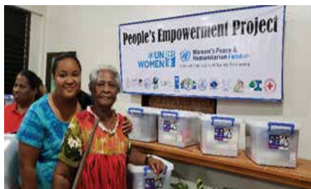
Ngiwal resident with her Family Disaster Toolkit