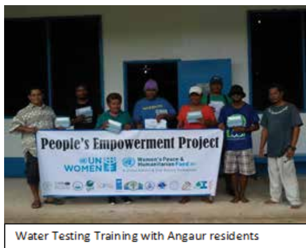
Water Testing Training with Angaur residents

Source: PEP Family Disaster Toolkit Training Attendance Sheet, PRCS 2019