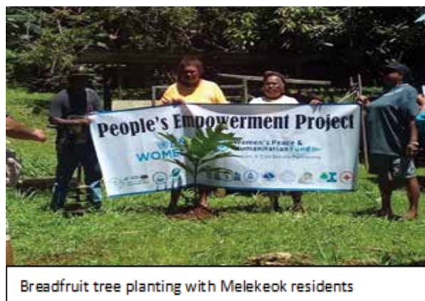
Breadfruit tree planting with Melekeok residents