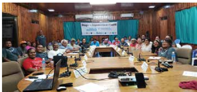
Town hall meeting in Ngchesar State Office, Ngchesar