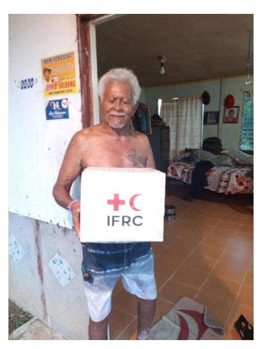
Photos Above: Aimeliik State R-DAT distributing family kits to Aimeliik state residents.