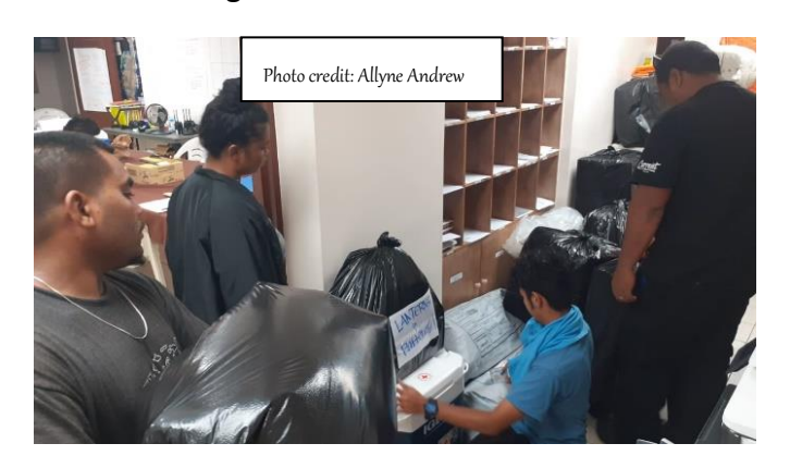
Tables below: Relief Supplies sent to Kayangel State Residents