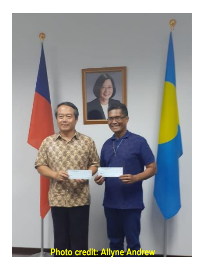
Photo below : His Excellency Ambassador Wallace Chow with PRCS National Board Chairman Santy Asanuma.

The Embassy of the Republic of China (Taiwan) donated 22,000 USD to Palau Red Cross Society of which 20,000 USD is for assistance with Typhoon Surigae and 2,000 USD specifically for Resource Mobilization and Fundraising activities.