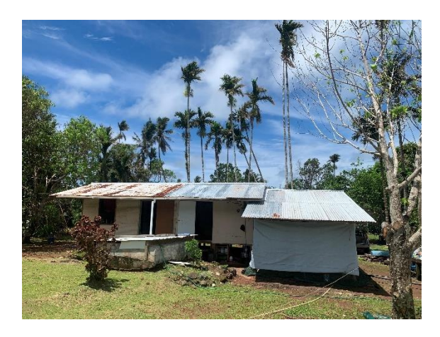
(Above Left) PCAA staff Reuben Inawo with PRCS staff Lei-Lynn Oseked handing out a family kit and tarp to a Headstart student's grandmother. (Above Right) The student's dwelling in Ngarchelong state (photo shows roof and water tank, which were damaged but have been repaired, and a temporary tarp covering windows).