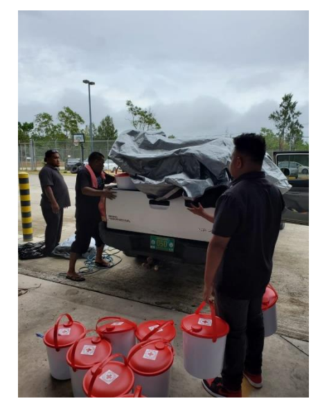
Photos above: PRCS staff and volunteers assisting Airai State R-DATs (left) and Ngatpang State R-DATs (right) in loading relief supplies into their trucks.