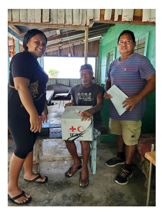
Photos above: Ngchesar state R-DATs visiting their residents and delivering Non-food items (NFIs) to them.