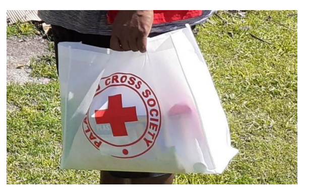
Hygiene kit (pictured above): Contents inside include toothbrushes & toothpaste, sanitary pads, face masks, and soap, among other hygiene items.