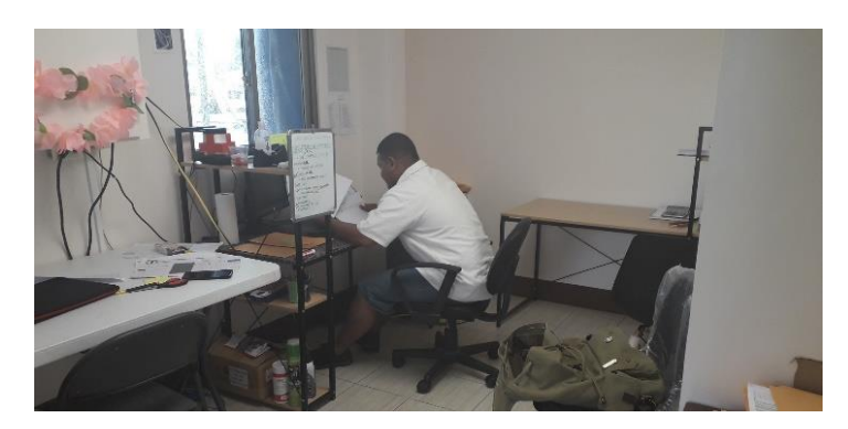
Left Photo: PRCS Data management staff working inside data room at PRCS HQ.

Initial Disaster Assessment (IDA) forms that were used by each state to assess households in the aftermath of Typhoon Surigae have all been submitted to PRCS. It is PRCS data management team's responsibility for inputting the raw data of each state's household. This includes the head of household, other people living in the household, damage category observed, as well as other relevant data. Since all state assessments have closed, the data team has been focusing on cross-matching, cleaning up, and creating distribution forms from the database.