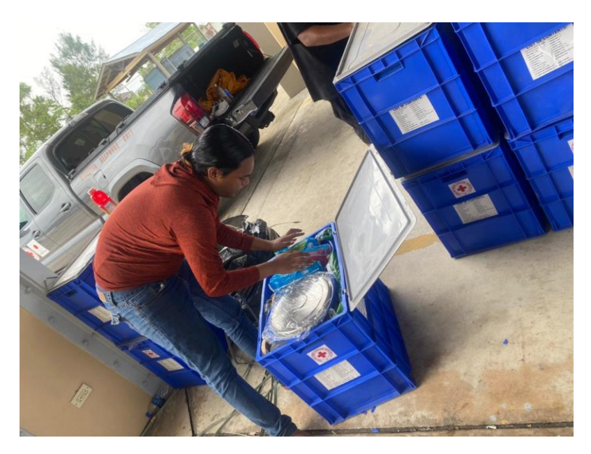
Photo above: PRCS staff preparing a family kit for distribution.

PRCS logistics and distribution teams continue to prepare Non-food items (NFIs) for distribution to the remaining households that were assessed after Typhoon Surigae in each state. Each State Government that receives the NFIs are responsible for their distribution.