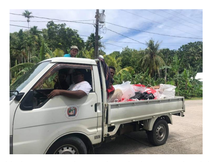
Melekeok state R-DATs and state employees distributing NFIs to household residents in their state.