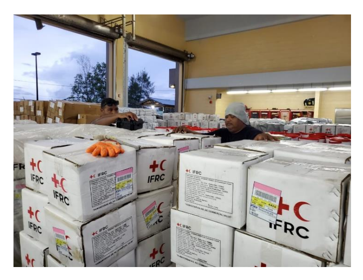
Hygiene kits (above photo) from International Federation of Red Cross & Red Crescent (IFRC). Contents include bath towels, toothbrush, toothpaste, & soap, among other items.

PRCS logistics and distribution teams continue to prepare Non-food items (NFIs) for distribution to the remaining households that were assessed after Typhoon Surigae in each state. Each State Government that receives the NFIs are responsible for their distribution.