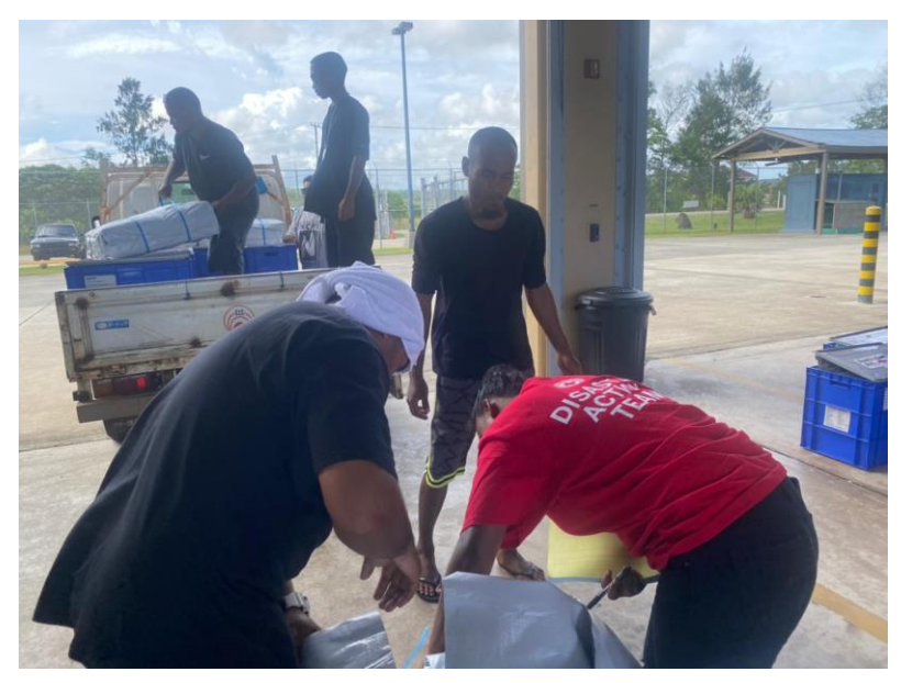
Photo Above: PRCS logistics & distribution team giving Ngarchelong state R-DATs a hand in loading NFIs unto their truck.

• Ngarchelong state R-DATs have picked up Non-food Items (NFIs) to distribute to households in their state that fall under Category 0 and 1 damage levels.