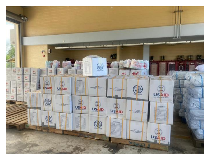
Photos above: Hygiene kits donated by International Organization for Migration (IOM) Agency in Palau.

• The hygiene kits that were donated by the International Organization for Migration Agency (IOM)Palau are being sorted and will be distributed soon to households assessed after Typhoon Surigae.