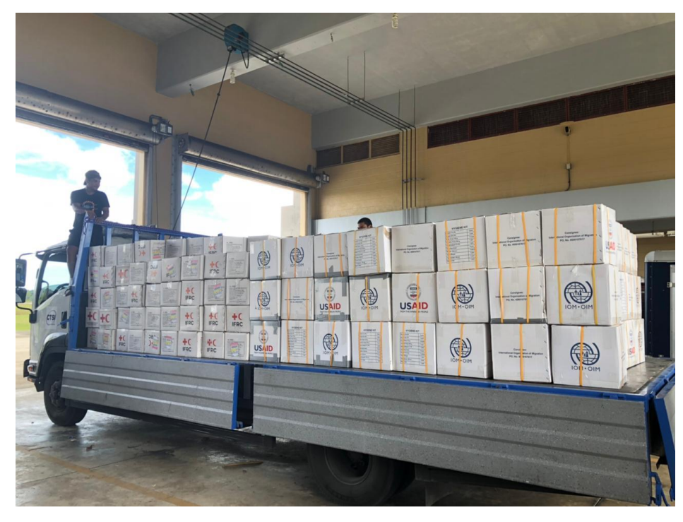
PRCS Staff and volunteers moving hygiene kits and other items to Koror State designated location. Koror State will then distribute to Koror State households with Category 0 & 1 damage levels.